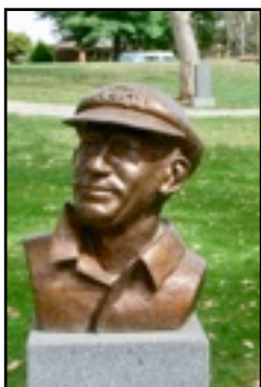
Don Bradman, legendary right-hand batsman, 52 tests 1929-48

This Riverina ramble had something of interest for all. The capable and friendly organising enterprise KTG Tours ensured everyone had a really good time away.